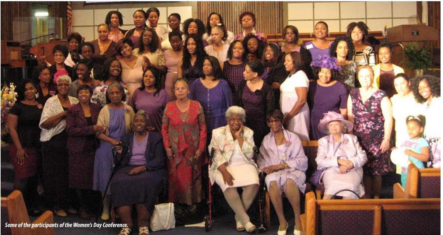
Some of the participants of the Women's Day Conference.

presented on the importance of balance and refueling in our busy lives. She gave the illustration that just as her brother ran out of gas trying to see how far he could get on a tank of gas before refueling, we do the same in our personal lives. As they say in Africa, "Hurry, hurry, bust pants," meaning we need to slow down and develop a "My God" experience that David expressed in Psalms 18.