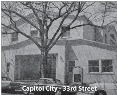
Capitol City - 33rd Street

The church has grown over the years by adding to its membership and creating a solid foundation of both old and new members. We continue to add to the church family daily. Praise the Lord!