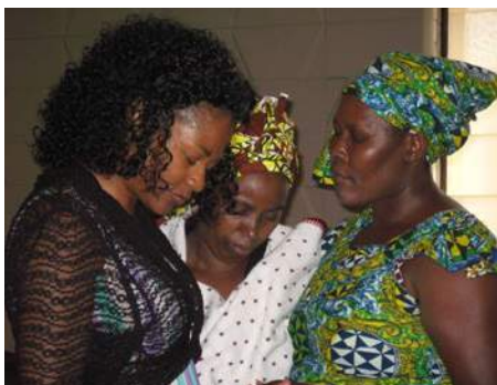
Ladies in prayer during the appeal.