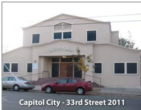
Capitol City - 33rd Street 2011