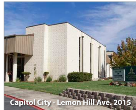
Capitol City - Lemon Hill Ave. 2015