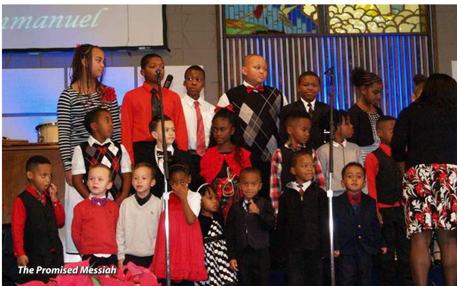
The Promised Messiah