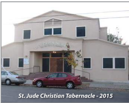
St. Jude Christian Tabernacle - 2015

Our Homecoming weekend was something to remember. It brought back many memories and it was inspiring. On Friday night, the weekend kick off was at the location of the old Capitol City SDA Church, now the home of the St. Jude Christian Tabernacle, located at 2828 33rd Street. It was an exciting time. Many of our members was in attendance who was part of the 33rd Street church. We had members who came from afar just to be part of this spectacular event. We even had a family who drove all the way from the State of Oregon just to help us celebrate Homecoming. He lit up the 33rd street church with his excitement while sharing his memories.