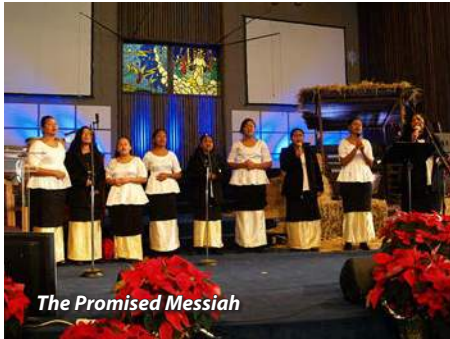
The Promised Messiah

December refused to be outdone with Pathfinders taking center stage on December 5th and our Worship and Arts team presenting the production “The Promised Messiah” on December 19th. The production blessed the souls of the capacity crowd that gathered and reminded us that the Jesus who was prophecies to come the first time is prophecies to return again.