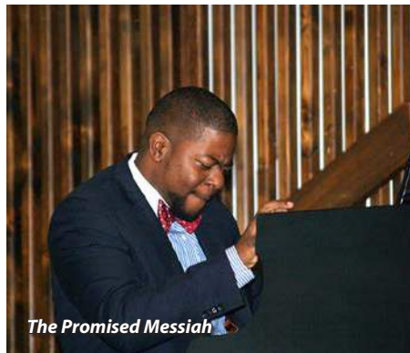
The Promised Messiah