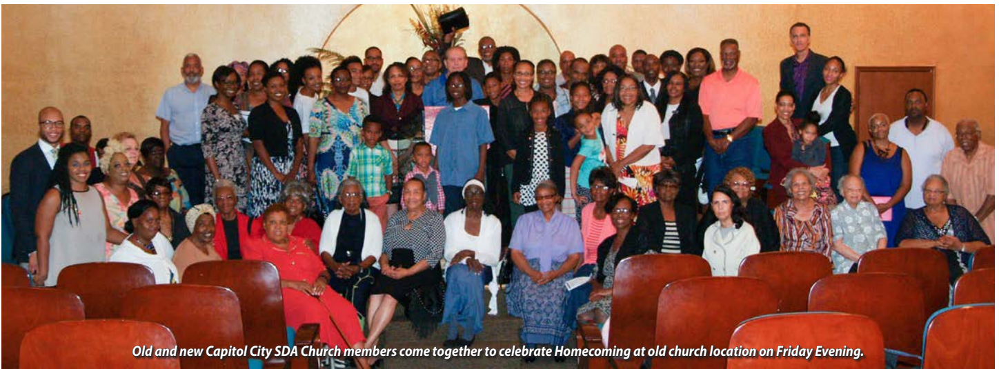
Old and new Capitol City SDA Church members come together to celebrate Homecoming at old church location on Friday Evening.