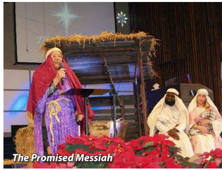
The Promised Messiah