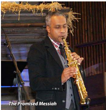
The Promised Messiah