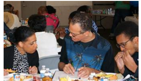
Members enjoy breakfast, fellowship and discuss strategies.