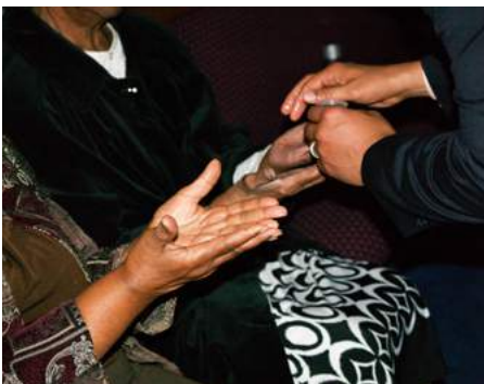
Pastoral staff and elders anointed all who attended the Commitment to Discipleship service on Saturday evening.