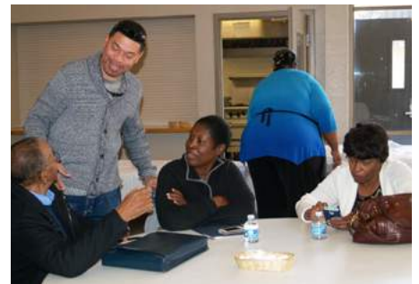
Attendees greet one another and look forward to getting their ministries moving forward.