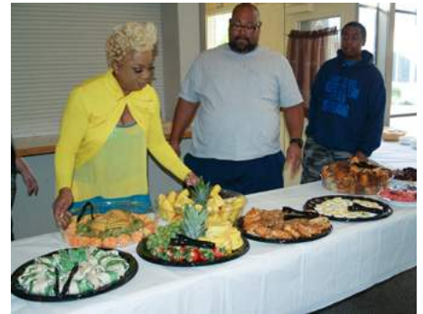
Hospitality Ministry leader prepared a delicious and healthy breakfast for those who attended the Sunday session.