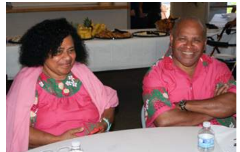
LeaderShape Conference attendees being blessed by the efforts of all of those who participated in the weekend events.