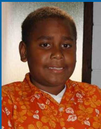
Tunicu Skioa Tikomainiusiladi