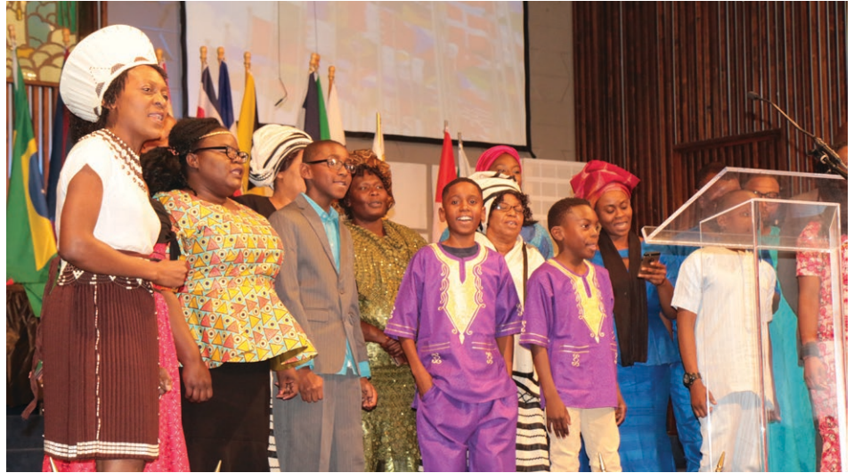
Several musical selections were given by the African Collective Choir at the afternoon concert.