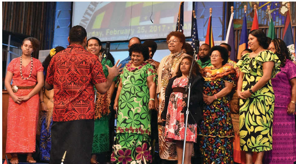
Special Music by the Fijian Choir

“It’s my third year participating in the International Nations’ Day! It’s so excited to be part of an event, which brings so much joy and fun to our community church. On International Day, the world is geographically and ethically present at Capitol City Church throughout everything: food,