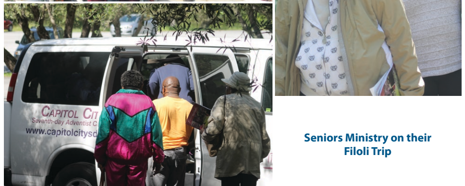
Seniors Ministry on their Filoli Trip