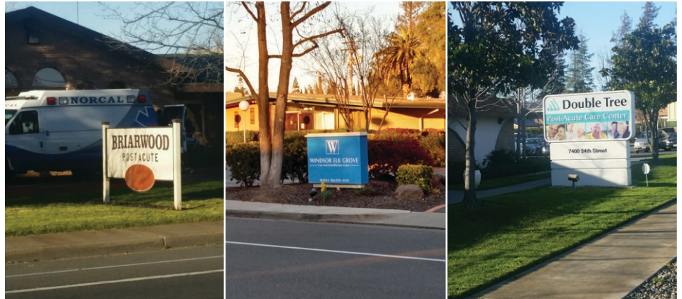
Delivered Christmas Cards to three nursing home locations